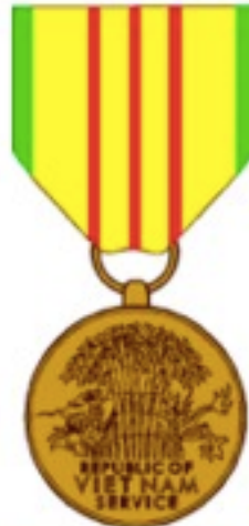
Vietnam Service Medal